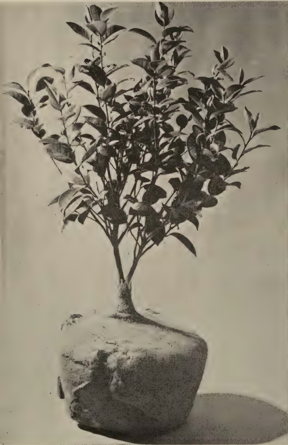
24-30 inch, Light Specimen Camellia B&B